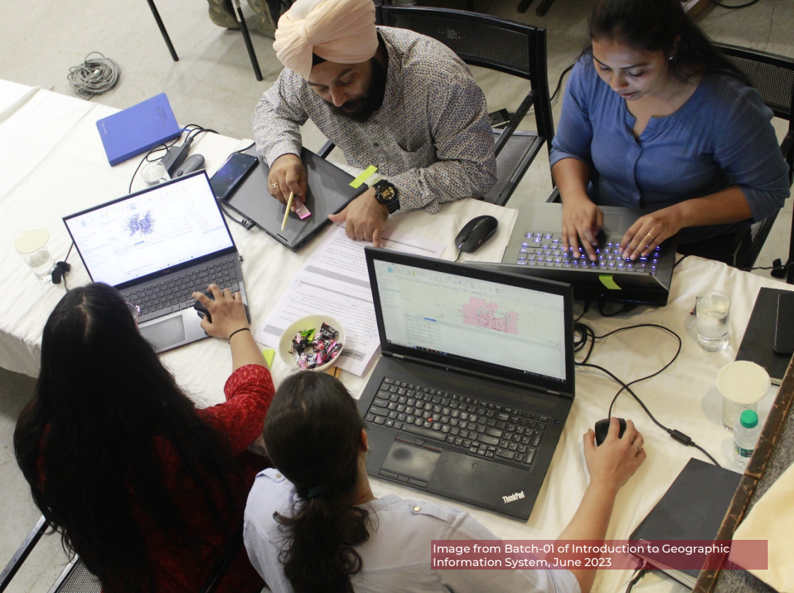
Image from Batch-01 of Introduction to Geographic Information System, June 2023