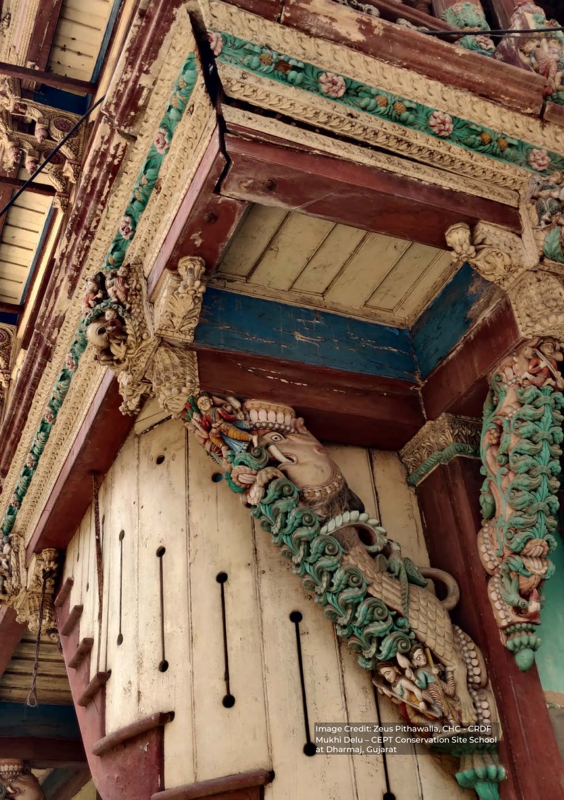
Image Credit: Zeus Pithawalla, CHC - CRDF Mukhi Delu - CEPT Conservation Site School at Dharmaj, Gujarat