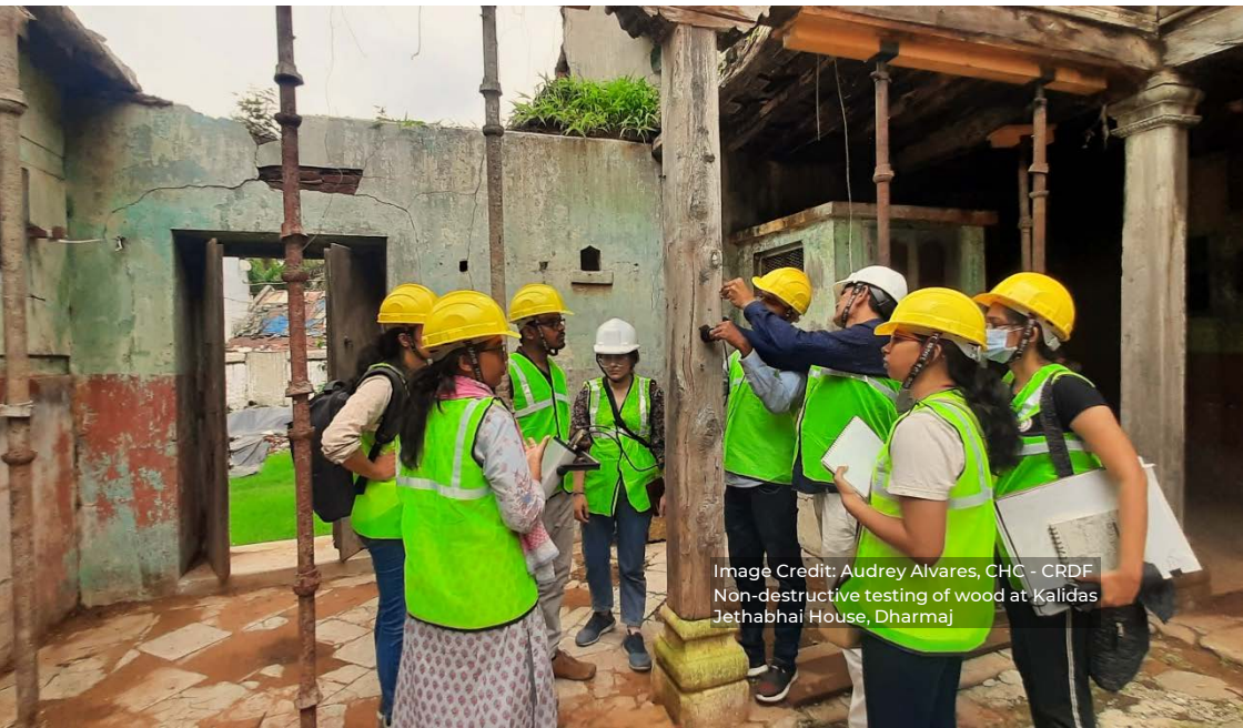
Non-destructive testing of wood at Kalidas Jethabhai House, Dharmaj