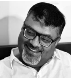
Anindo Chatterjee Guest Speaker