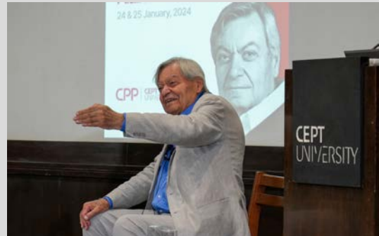
Snapshots from Master Class of Alain Bertaud at CEPT (2024)