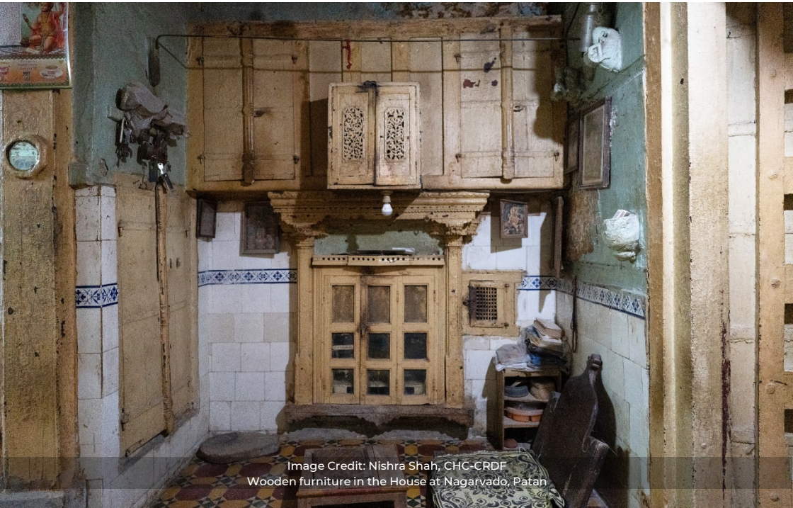
Wooden furniture in the House at Nagarvado, Patan

CPP draws from the expertise and capacity of the accomplished faculty at CEPT University, enhanced further by experts and practitioners from the field. Its programmes are built on deep research, vast consultancy projects and innovative pedagogies. CPP offers a repertoire of short programs and topic focused programs across disciplines of architecture, design, planning, and management with immersive learning approaches combining interactive lectures, case studies, and peer-to-peer exchanges.