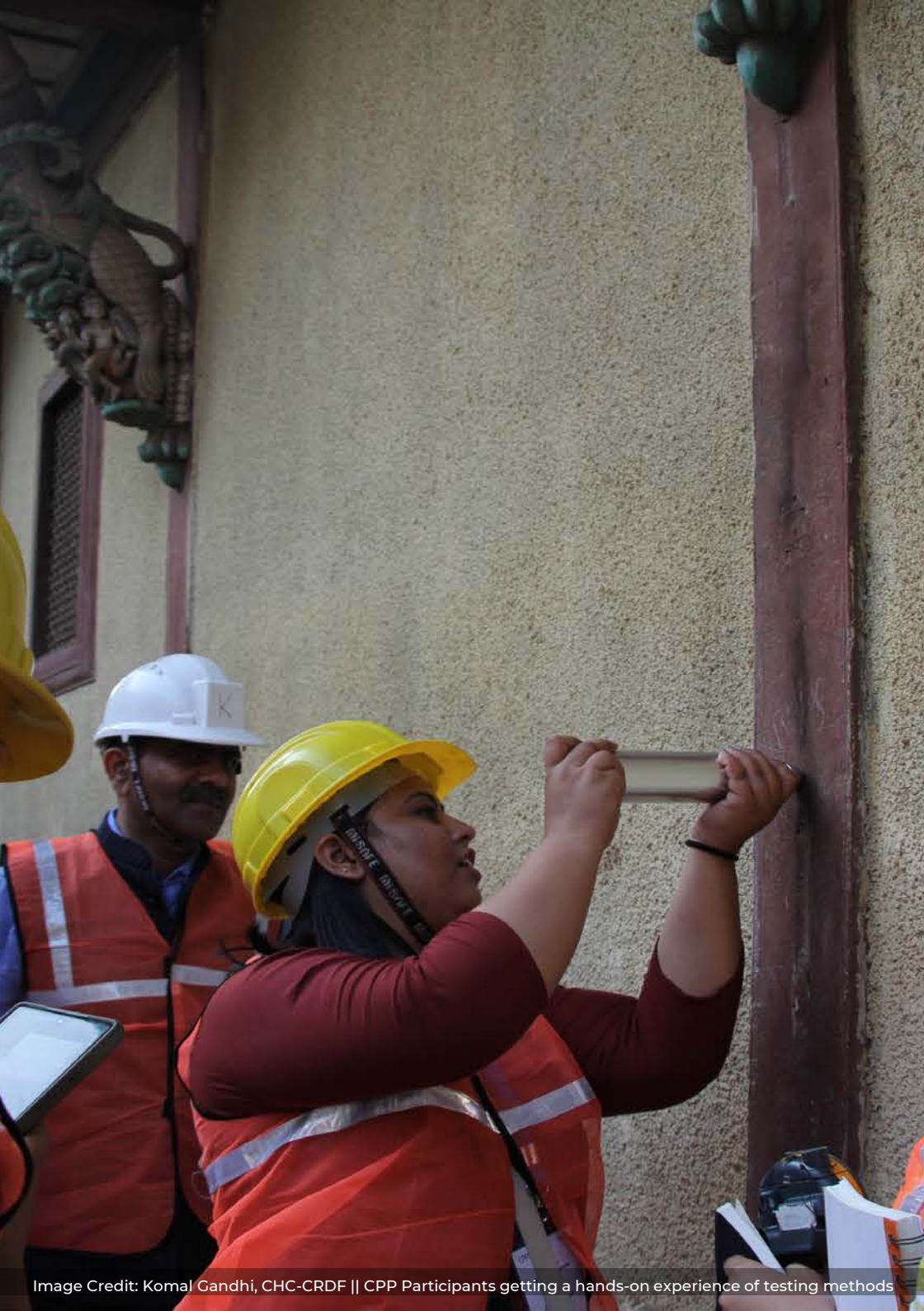
CPP Participants getting a hands-on experience of testing methods